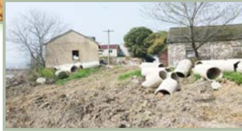
◀ Surroundings of the solar power plant in Fanchang County (original features)